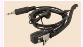
Earphone with Mic & PTT

* Standard Accessories include battery ST-B50L, Adaptor ST-C52, USB Cable, User Manual